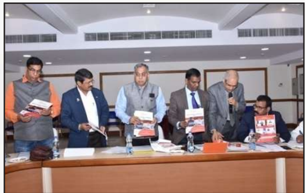
343rd National Council Meeting held on 10th February, 2019 at BEL Officer's Club, Bangalore