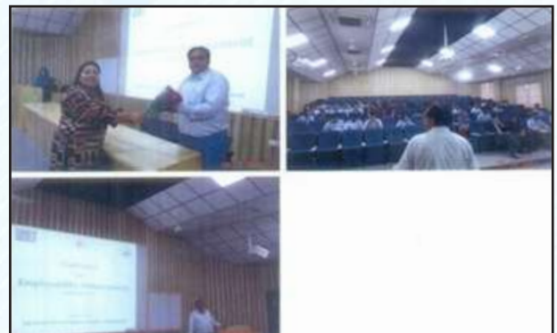
Session 4 : Goal Setting Speaker : Mr. Arun Mishra Schedule : 9th March 2019, 2 pm to 5 pm