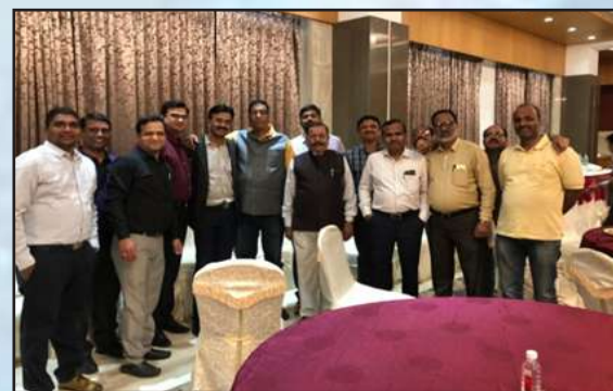
Nashik Chapter also organized monthly programme with Progenesis Group on "Life Style Management" on 1st March, 2019 at Hotel SSK Solitare, Nashik.