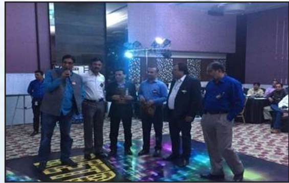
NIPM-Nashik Chapter organized monthly programme with Shaydri Group & NIPM Mumbai WRC Team on 15th February, 2019 at Hotel BLVD, Trimbak Road, Nashik.