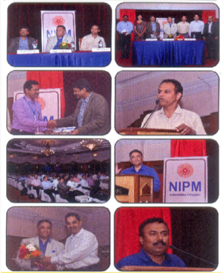
Glimpses of Evening Lectures of Karnataka Chapter