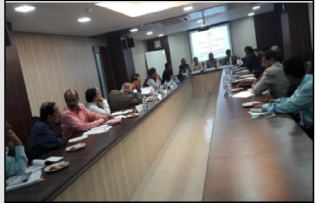
341st National Council Meeting held on 27th October, 2018 at Kolkata

The Hon. General Secretary informed that as per Regulation 12 of the NIPM Constitution four members are to be co-opted in the National Council 2018-2020. The National President also proposed the names of the Special Invitees in the National Council 2018-2020. National Council approved the names for Co-option and Special Invitees.